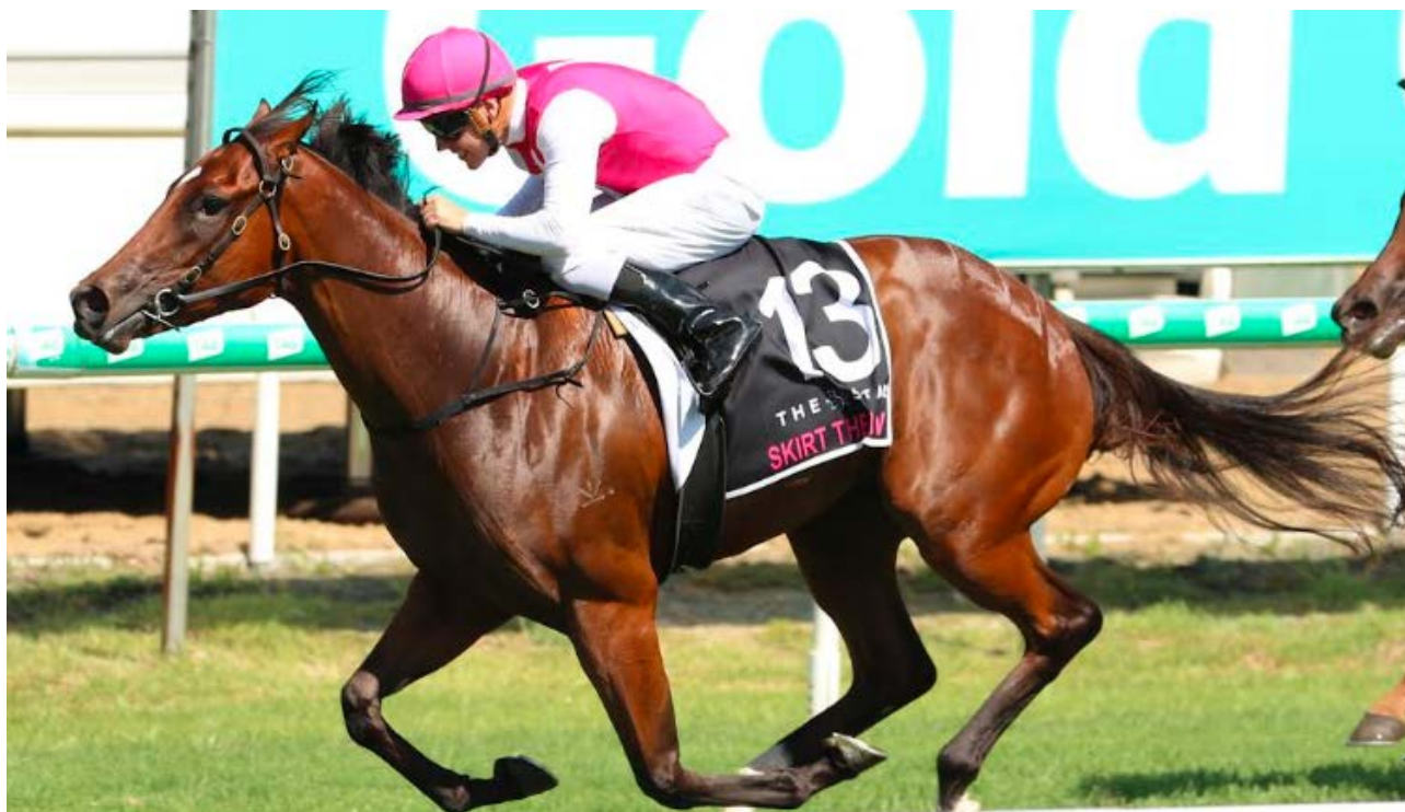
Magic Millions 2 Year Old Classic Winner - Skirt The Law