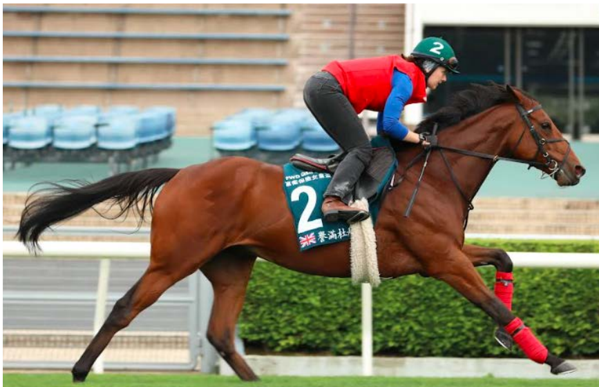
Dubai Honour – Winno on track at Hong Kong

Sandown R7 Do Ya Punk Morph R10 Dual Fuel Ascot R6 Pot Shot