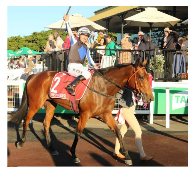
Gypsy Goddess winner of Queensland Oaks